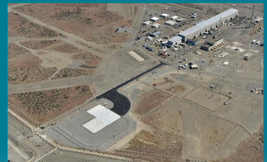
Aerial photo of the Capsule Storage Area, bottom left, about a half-mile from the Waste Encapsulation and Storage Facility, top right (adjacent to longer B Plant).