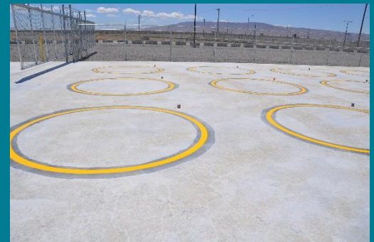
Construction is complete on a dry storage area for the WESF capsules.