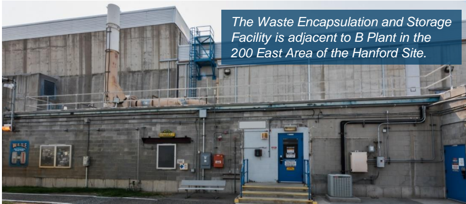
The Waste Encapsulation and Storage Facility is adjacent to B Plant in the 200 East Area of the Hanford Site.

The U.S. Department of Energy and contractor Central Plateau Cleanup Company are preparing to transfer 1,936 radioactive capsules from the Waste Encapsulation and Storage Facility to safer dry storage.