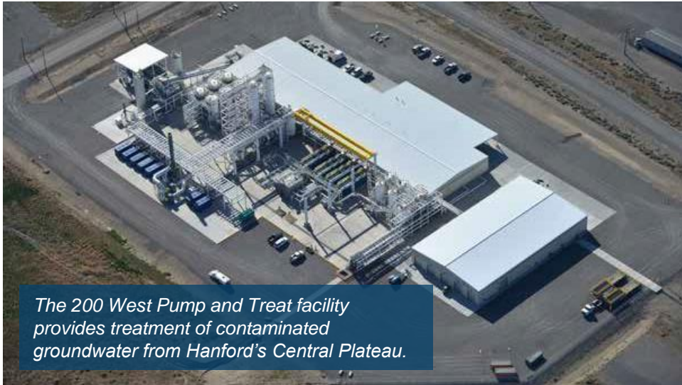
The 200 West Pump and Treat facility provides treatment of contaminated groundwater from Hanford's Central Plateau.

The U.S. Department of Energy and contractor Central Plateau Cleanup Company are safely cleaning up groundwater at the Hanford Site.