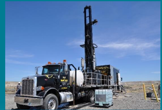
Well drilling operations on the Central Plateau.