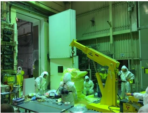
Workers safely remove waste from the airlock, an area adjacent to B Cell.