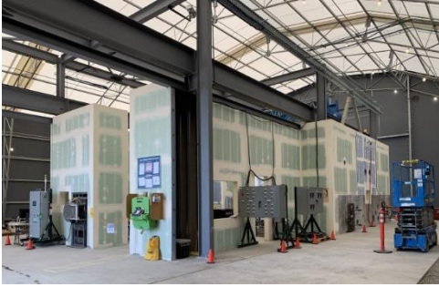
A full-scale mock-up facility replicates features inside the 324 Building.