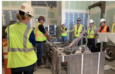
Workers tested a saw at the mock-up that will be installed in B Cell to cut through the stainless steel liner and the concrete floor.